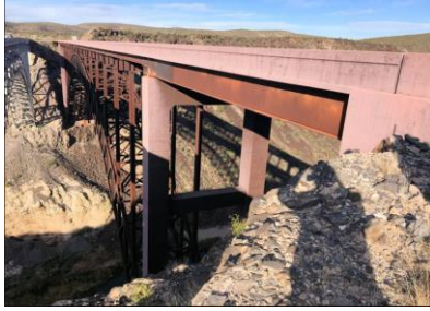
Burro Creek NB Bridge US 93 over Burro Creek ~ 60 Miles North of Wickenburg, Arizona Built in 2006