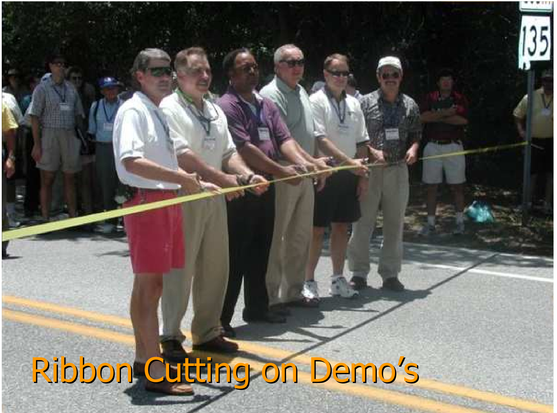
Ribbon Cutting on Demo's