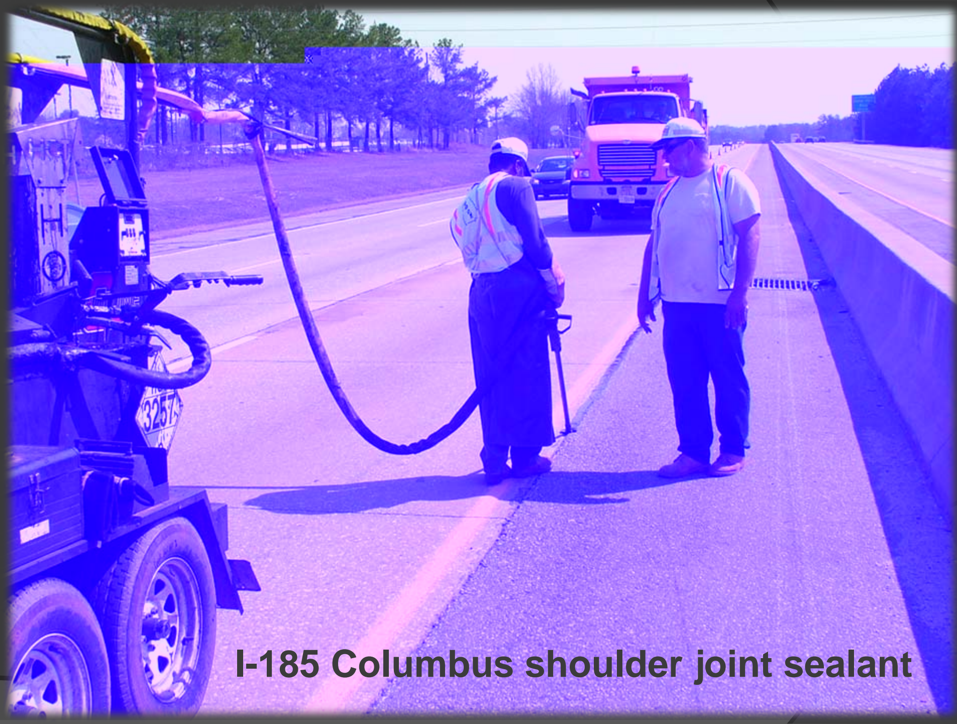
I-185 Columbus shoulder joint sealant